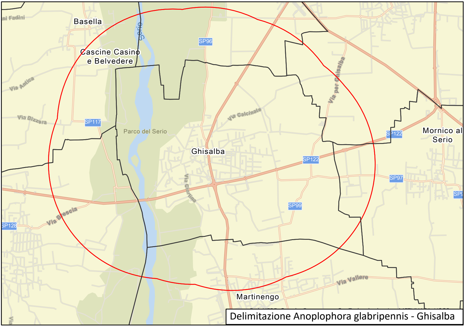
Delimitazione Anoplophora glabripennis - Ghisalba